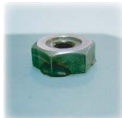
M4 ~ M6

Nut Welding : Flange type nut has more strength and less damage of screw by distributing current from flange part.