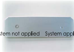
System not applied System applied