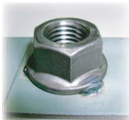
M6 ~ M12